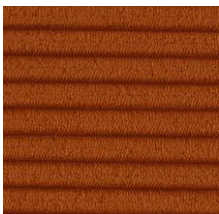
595-CORDUROY BURNED ORANGE