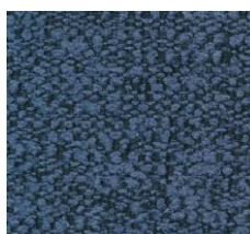
537- BOUCLÉ BLUE