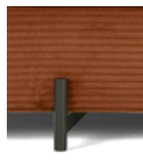
DB INDU METALL SCHWARZ