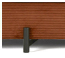
DB INDU METAL BLACK