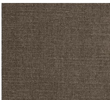
411 ESINA CEDAR BROWN