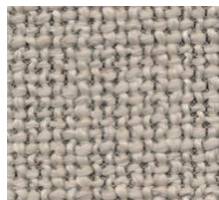
579 KENYA GRAVEL