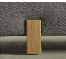
DB DRIP OAK LACQUERED