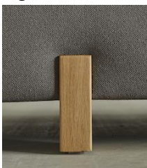
DB DRIP EICHE LACKIERT