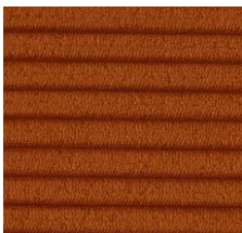
595-CORDUROY BURNED ORANGE