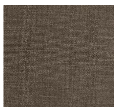
411 ESINA CEDAR BROWN