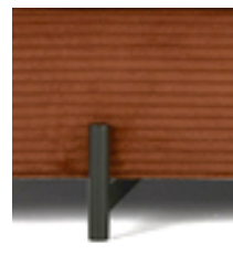
DB INDU METALL SCHWARZ