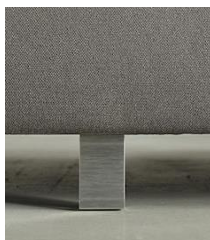
DB CUBE ALUMINIUM