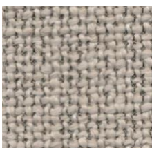
579- KENYA GRAVEL