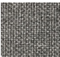
563- TWIST CHARCOAL