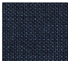
528- MIXED DANCE BLUE