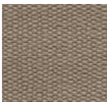
587- PHOBOS MOCHA