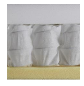
NORDIC Soft Spring extra soft

Fiberfill Latex core Fiberfill appr. 13 cm high