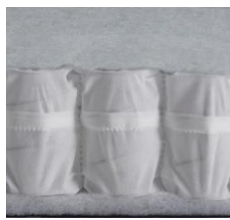
NORDIC Spring medium

Fiberfill freon-free polyether foam Fiberfill appr. 13 cm high