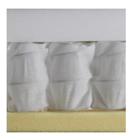
NORDIC Soft Spring extra soft

thick layer of fiberfill Pocket spring Fiberfill appr. 15 cm high