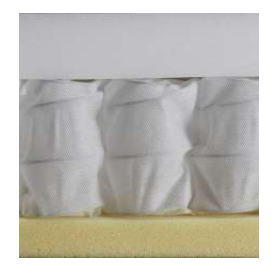
NORDIC Soft Spring extra soft

thick layer of fiberfill Pocket spring Fiberfill approx. 15 cm high