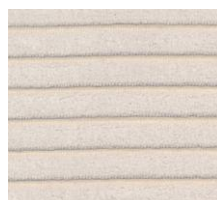
594 CORDUROY IVORY