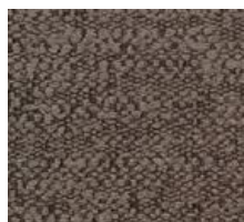
530 BOUCLE TAUPE