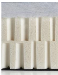
NORDIC Latex medium Fiberfill Latex core Fiberfill approx. 13 cm high