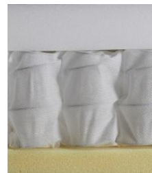
NORDIC Soft Spring extra soft 1 layer of hyper soft foam membrane bound pocket spring 1 layer of hyper soft foam approx. 17 cm high

Every single mattress is handmade with great care and attention to quality and details at the INNOVATION LIVING™ factory in Denmark.