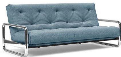
NORDIC - with bindings