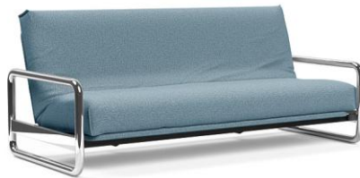
NORDIC -Cover detachable