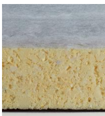
NORDIC Classic firm Fiberfill freon-free polyether foam Fiberfill approx. 13 cm high