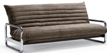
QUILTUS - kaschierter Wechselbezug