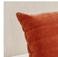
QUILTUS Cover laminated fabric with cross-stitching