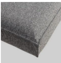
Sharp Plus Cover sharp