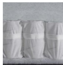
NORDIC Spring medium thick layer of fiberfill Pocket spring Fiberfill approx. 15 cm high