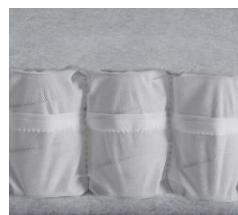
NORDIC Spring medium

Fiberfill freon-free polyether foam approx. 14 cm high