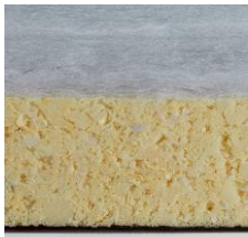
NORDIC Classic firm

Fiberfill freon-free polyether foam approx. 14 cm high