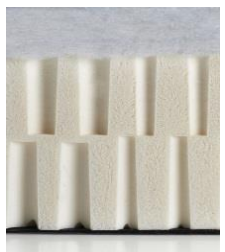
NORDIC Latex medium

thick layer of fiberfill Pocket spring Fiberfill approx. 14 cm high