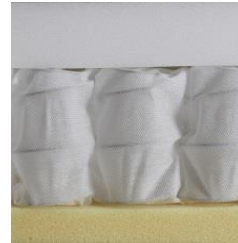
NORDIC Soft Spring extra soft

Fiberfill Latex core Fiberfill approx. 14 cm high