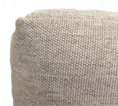
Nordic Cover round