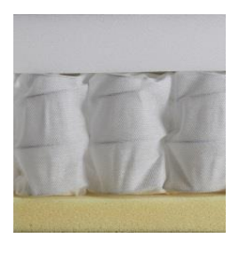
NORDIC Soft Spring extra soft

thick layer of fiberfill Pocket spring Fiberfill appr. 15 cm high