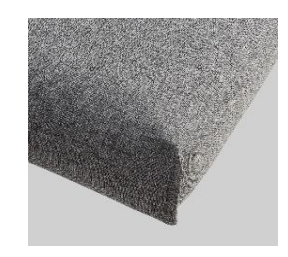
Nordic Cover round