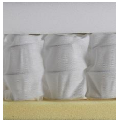
NORDIC Soft Spring extra soft 1 layer of hyper soft foam membrane bound pocket spring 1 layer of hyper soft foam appr. 17 cm high

Every single mattress is handmade with great care and attention to quality and details at the INNOVATION LIVING™ factory in Denmark.