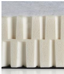
NORDIC Latex medium Fiberfill Latex core Fiberfill appr. 13 cm high