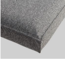
Sharp Plus Cover sharp