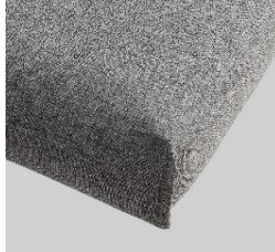
Nordic Cover round