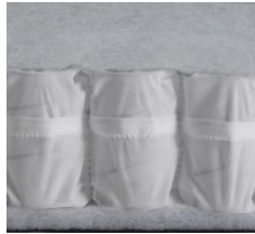
NORDIC Spring medium thick layer of fiberfill Pocket spring Fiberfill appr. 15 cm high