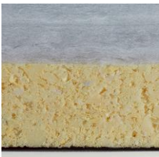
NORDIC Classic firm Fiberfill freon-free polyether foam Fiberfill appr. 13 cm high